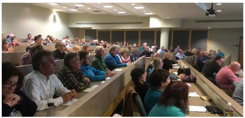
Tax Topics : Approximately 120 tax preparers attended the Division of Taxation's "Seminar for Tax Preparers" (see above) held at the Community College of Rhode Island's Knight campus in Warwick in December 2019.

plans, annuities, and other such sources, and for a separate tax break involving income from Social Security benefits. This special edition of Rhode Island Tax News includes information about these and other filing -season matters.