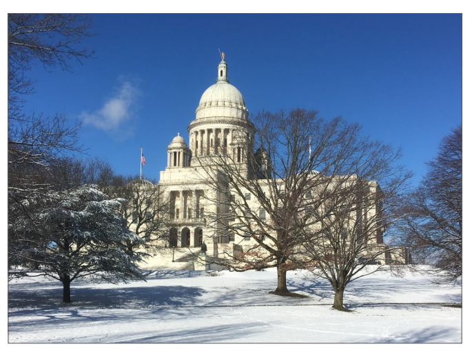
State House : Legislation approved by the Rhode Island General Assembly in 2019 included many changes to Rhode Island's tax laws, some of which are now in effect and summarized in this edition of Rhode Island Tax News.

Meanwhile, the threshold for Rhode Island's estate tax has increased for 2020, meaning that fewer estates will be subject to the tax, leaving more assets available for heirs and other beneficiaries. These are among the topics covered in this issue of Rhode Island Tax News .