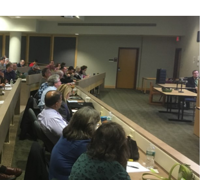
Seminar : More than 100 tax professionals attended the Rhode Island Division of Taxation's "Seminar for Tax Preparers" held December 7, 2018, at the Community College of Rhode Island's Knight Campus in Warwick.

There's a new schedule that you must file with your resident or nonresident