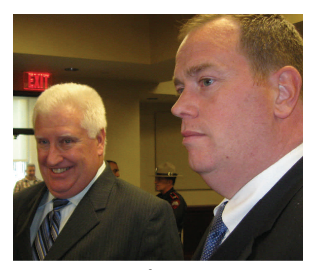
On the case

Four others arrested at about the same time as Mohamad last fall face state criminal charges.