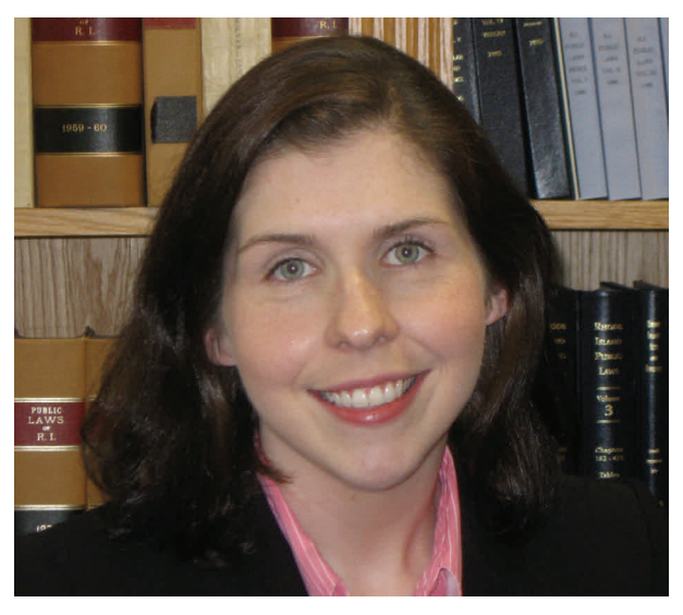
Chief of Estate Tax

He was also an easy-going, friendly and likeable colleague. It was rare to see him without a smile, and it was a pleasure to