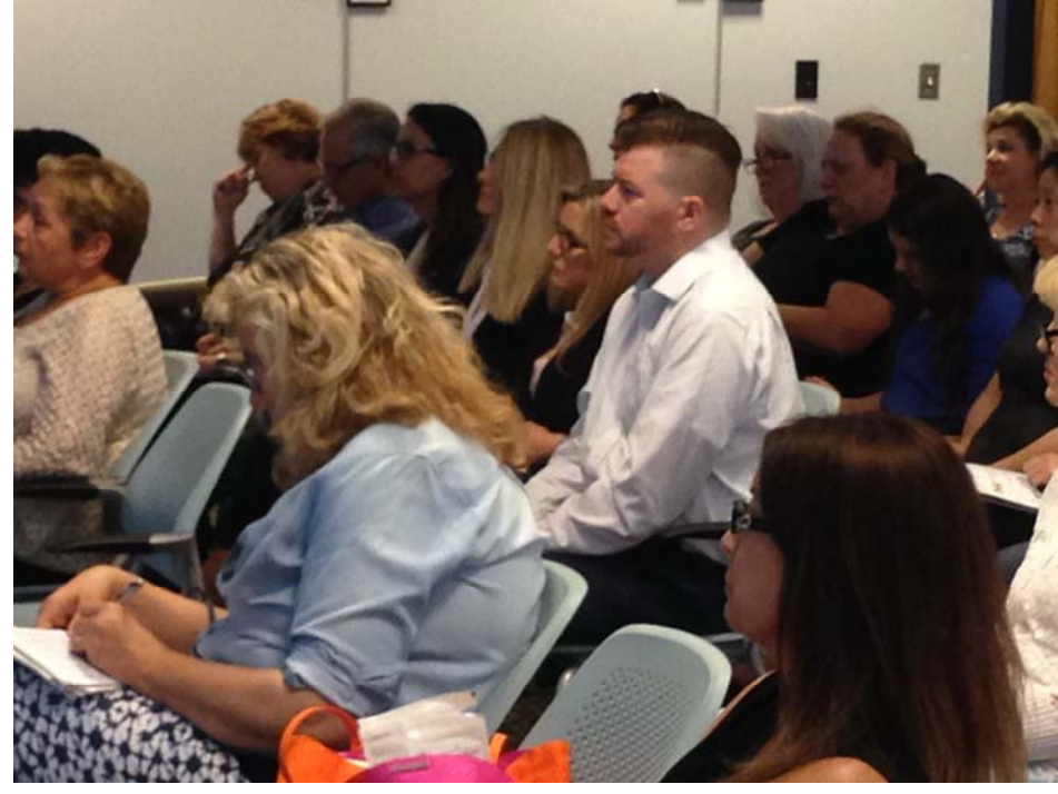
Attending: More than 50 business owners, bookkeepers, tax advisers, and others attended the Division of Taxation's seminar in June, held at the Warwick Public Library (Central Library). The seminar focused on the sales tax, the use tax, and the self-audit program, and also included a discussion of new account ID numbers.