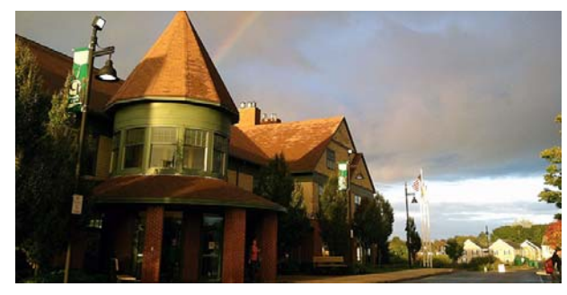
Newport County Campus: The seminar for tax preparers will be held at the CCRI Newport County Campus (see photo above) in Newport on Thursday, November 2, 2017, from 9:00 a.m. to 12:00 noon, in the main auditorium. For directions: