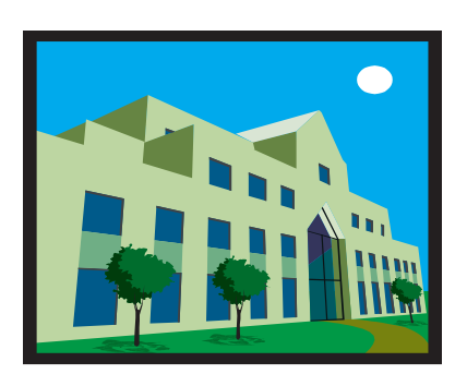
In person Monday through Friday 8:30<sup>am</sup> to 3:30<sup>pm</sup>

Free walk-in assistance and forms are available Monday through Friday 8:30<sup>am</sup> to 3:30<sup>pm</sup>. One Capitol Hill · Providence, RI · 02908-5800