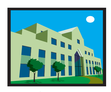
In person 8:30<sup>am</sup> to 3:30<sup>pm</sup>

Free walk-in assistance and forms are available Monday through Friday 8:30<sup>am</sup> to 3:30<sup>pm</sup>. One Capitol Hill · Providence, RI · 02908-5800