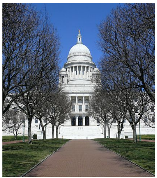
Ad Meskens via Wikimedia Commons