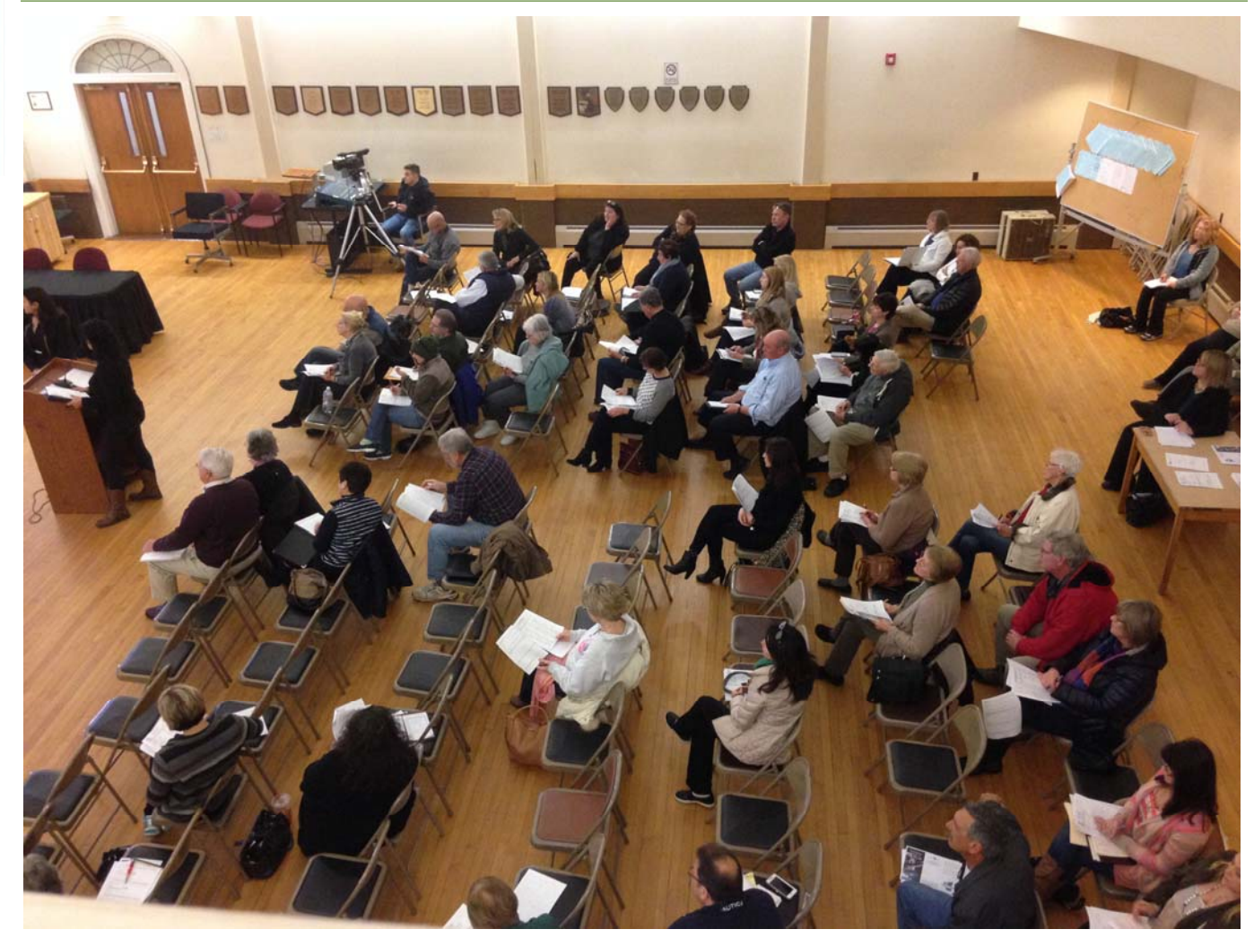
Overview: Division of Taxation officials provided an overview of taxes on short-term residential rentals in February (see above) at Narragansett Town Hall. The seminar was for property owners, real estate agents, tax professionals, and others.