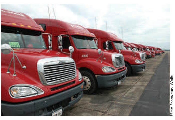
Motor Carriers : Trucks like those pictured above that are driven on roads and highways are subject to motor fuel tax.

Currently, Rhode Island is a participating member (along with about 11 other jurisdictions) in a regional processing center in Albany, N.Y., which is hosted by the State of New York. The regional center processes, calculates, and col-