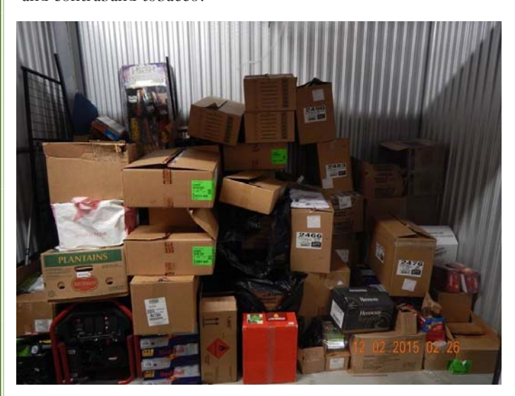
Storage : Rhode Island State Police, in a joint investigation with the Rhode Island Division of Taxation's Special Investigation Unit and others, uncovered untaxed tobacco products in a recent case.

If you have information about wrongdoing involving state taxes, call the tax fraud tip line at (401) 574-TIPS or (401) 574- 8477 and leave a message. The line is staffed by the Rhode Island Division of Taxation's Special Investigation Unit, which follows up on all tips. Callers can leave their names and contact information or remain anonymous.