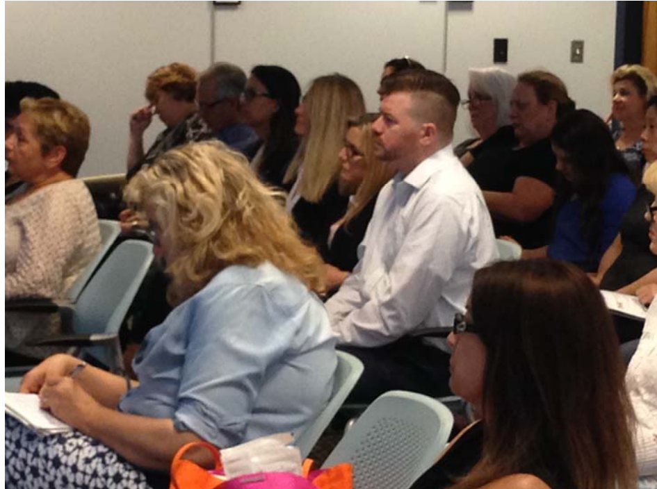
Attending: More than 50 business owners, bookkeepers, tax advisers, and others attended the Division of Taxation's seminar in June, held at the Warwick Public Library (Central Library). The seminar focused on the sales tax, the use tax, and the self-audit program, and also included a discussion of new account ID numbers.

The Division is gradually phasing in the use of the new account ID numbers. For example, on notices that were recently mailed to certain trusts that filed returns on Form RI-1041, the agency included only each trust's new account ID number, thus limiting the use of the trust's federal ID number.